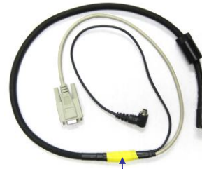
yellow heat shrink

This cable is included as a standard accessory with the PhytoFind and can be identified by the yellow band of heat shrink. The continuous data cable is used to connect the PhytoFind to a PC or data logger, supplying power to the instrument and streaming data.